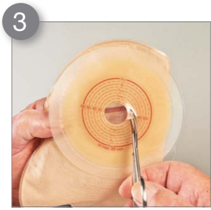
3 Cut the skin protection of your pouch to the size of your stoma.