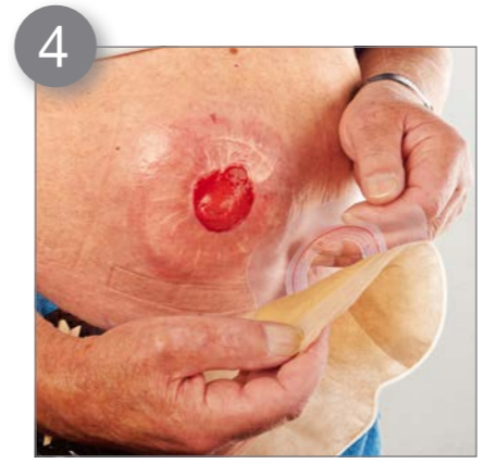
4 Now remove the protective film from the skin protection of your baseplate.