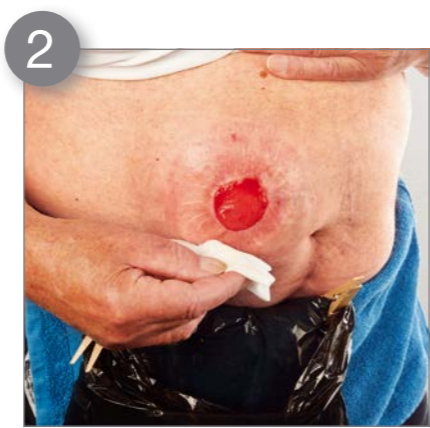
2 Clean the skin surrounding the stoma from the outside to the inside. In the case of a urostomy, clean from the inside outwards.