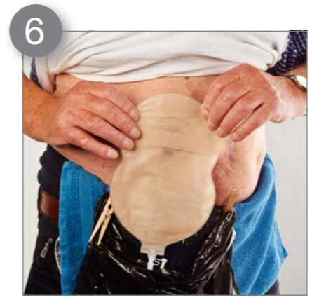
6 Warm up the skin protection and mold it gently to your body.