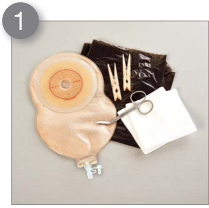
1 Make sure that you have all the materials you will need ready.