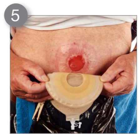
5 Place the opening of the pouch at the lower edge of the stoma and attach it from the bottom upwards.